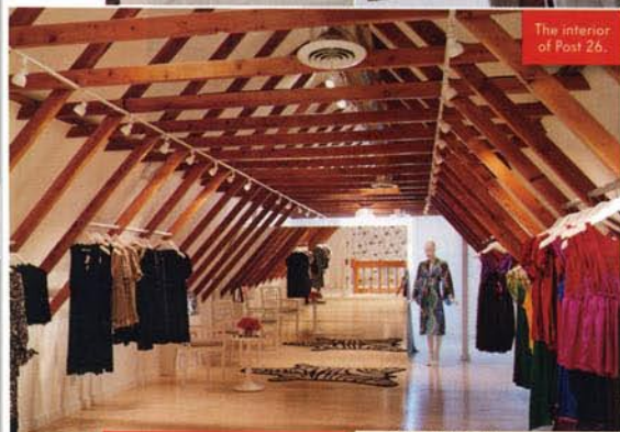
The interior of Post 26.