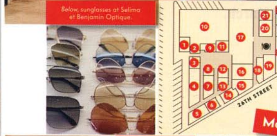
Below, sunglasses at Selima et Benjamin Optique.