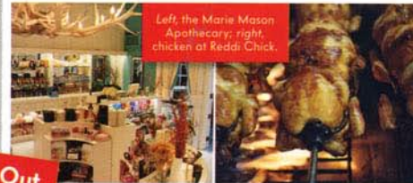
Left, the Marie Mason Apothecary; right, chicken at Reddi Chick.